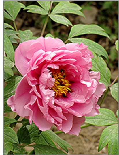
Cong Zhong Xiao Tree Peony flowers