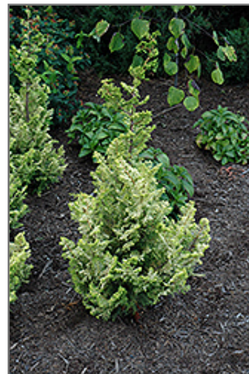
Lucas Hinoki Falsecypress