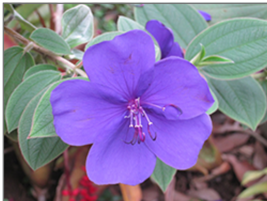
Princess Flower flowers

Princess Flower is recommended for the following landscape applications;