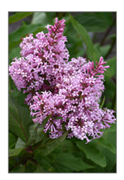
James MacFarlane Lilac flowers