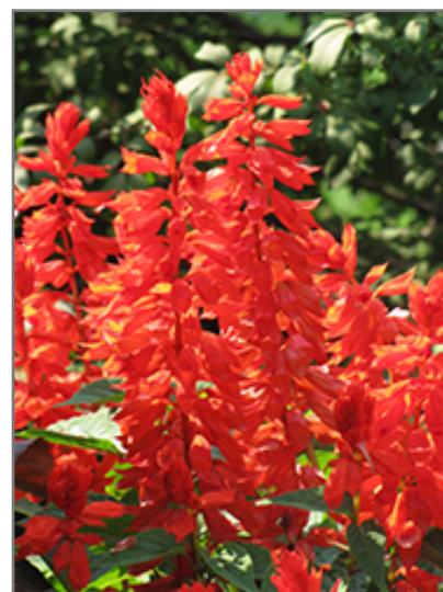
Lighthouse Red Sage flowers