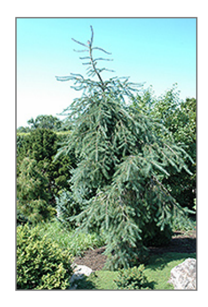
Weeping Will Weeping Douglas Fir