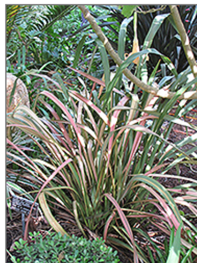
Jester New Zealand Flax