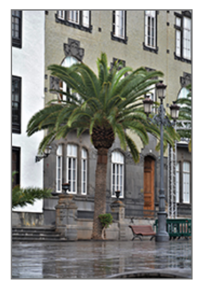
Canary Island Date Palm

This tree does best in full sun to partial shade. It does best in average to evenly moist conditions, but will not tolerate standing water. It is not particular as to soil type or pH. It is somewhat tolerant of urban pollution. This species is not originally from North America.