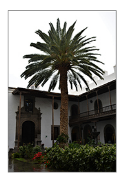
Canary Island Date Palm

Canary Island Date Palm is recommended for the following landscape applications;