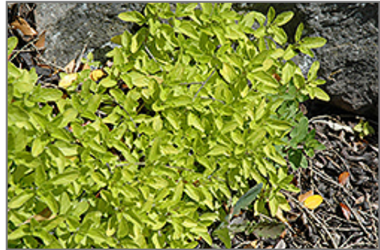
Thumbles Variety Oregano

Aside from its primary use as an edible, Thumbles Variety Oregano is suitable for the following landscape applications;