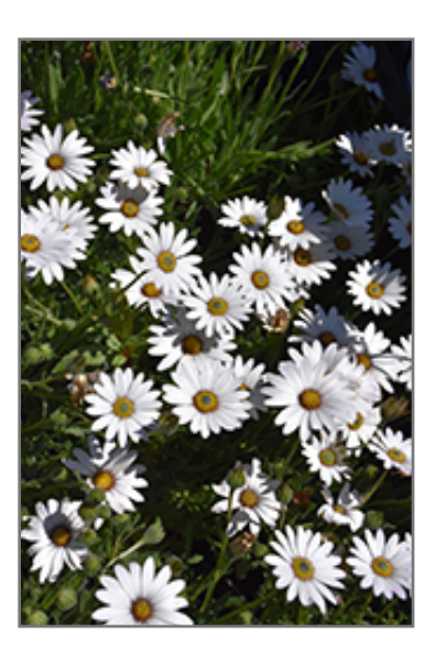
Avalanche African Daisy flowers