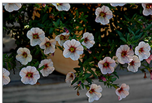
Celebration Mozart Calibrachoa flowers