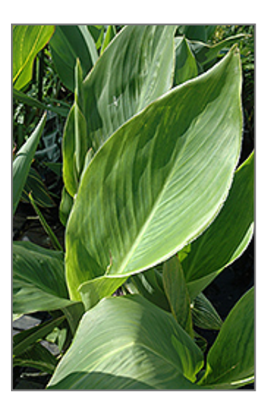
Striped Beauty Canna foliage