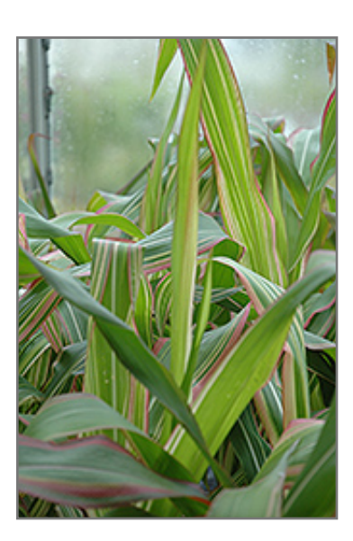
Field Of Dreams Ornamental Corn foliage

Field Of Dreams Ornamental Corn will grow to be about 5 feet tall at maturity, with a spread of 24 inches. When grown in masses or used as a bedding plant, individual plants should be spaced approximately 18 inches apart. It tends to be leggy, with a typical clearance of 2 feet from the ground, and should be underplanted with lower-growing perennials. This fast-growing annual will normally live for one full growing season, needing replacement the following year.