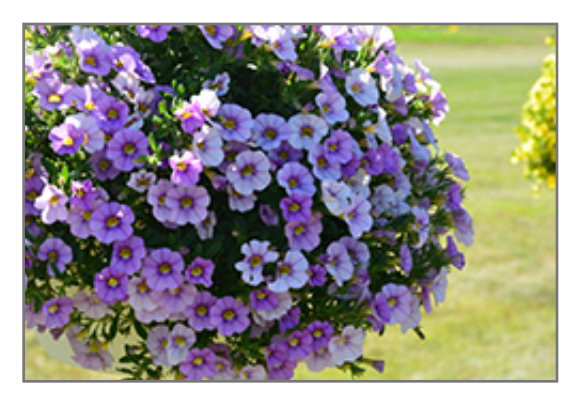
Aloha Blue Sky Calibrachoa in bloom