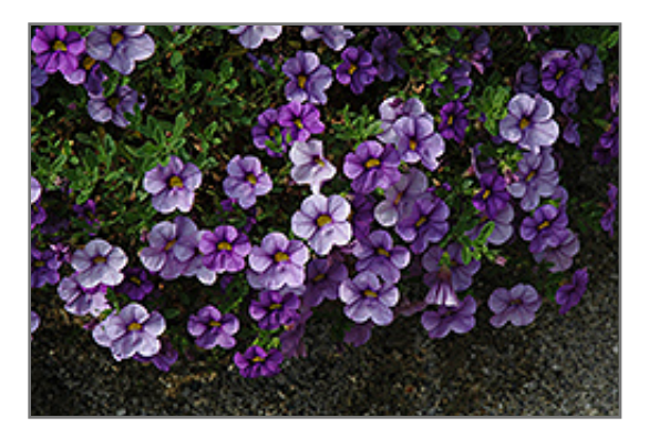
Aloha Blue Sky Calibrachoa flowers