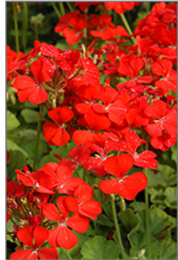
Crystal Palace Gem Geranium flowers