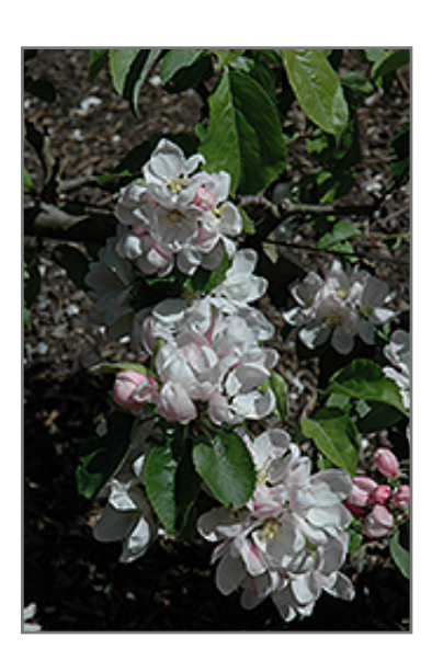
Golden Russet Apple flowers

This is a deciduous tree with an upright spreading habit of growth. Its average texture blends into the landscape, but can be balanced by one or two finer or coarser trees or shrubs for an effective composition. This is a high maintenance plant that will require regular care and upkeep, and is best pruned in late winter once the threat of extreme cold has passed. Gardeners should be aware of the following characteristic(s) that may warrant special consideration;