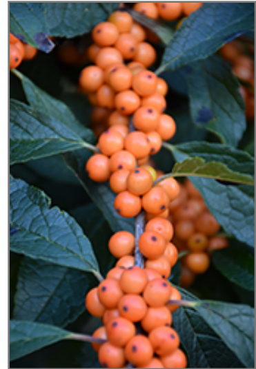
Winter Gold Winterberry fruit