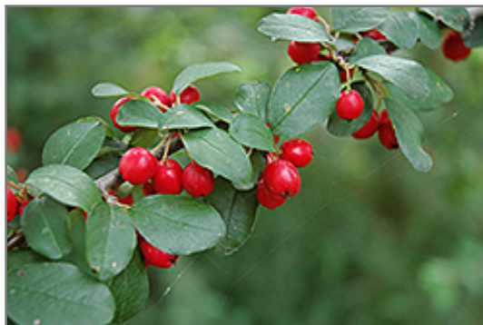
European Cotoneaster fruit