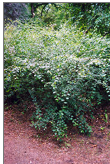
European Cotoneaster