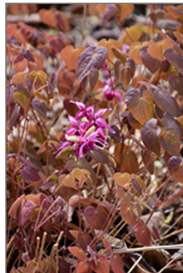
Yubae Bishop's Hat flowers