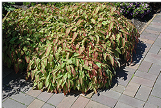
La Rocaille Bishop's Hat in bloom

La Rocaille Bishop's Hat is recommended for the following landscape applications;