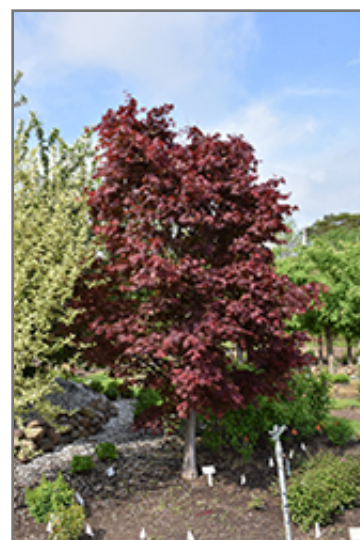
Samurai Sword Japanese Maple