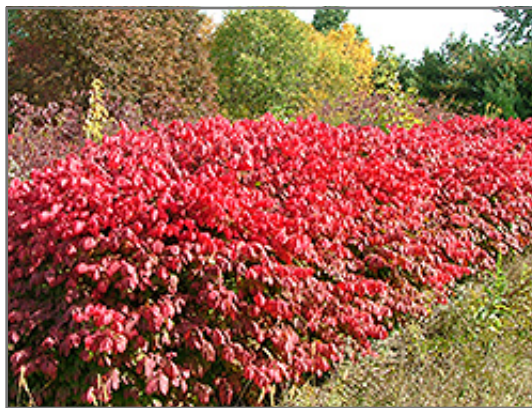
Pipsqueak Winged Burning Bush in fall