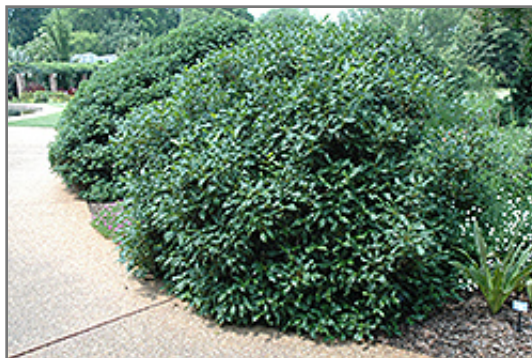
Jermyn's Globe Viburnum