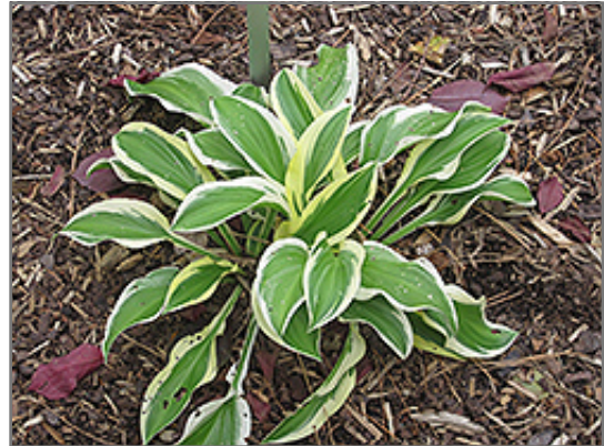
Iron Gate Delight Hosta