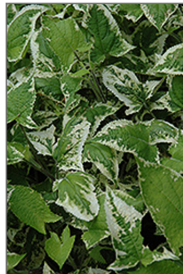
Fuji Snow Variegated Japanese Sage foliage

This is a relatively low maintenance plant, and is best cleaned up in early spring before it resumes active growth for the season. It is a good choice for attracting bees, butterflies and hummingbirds to your yard, but is not particularly attractive to deer who tend to leave it alone in favor of tastier treats. It has no significant negative characteristics.