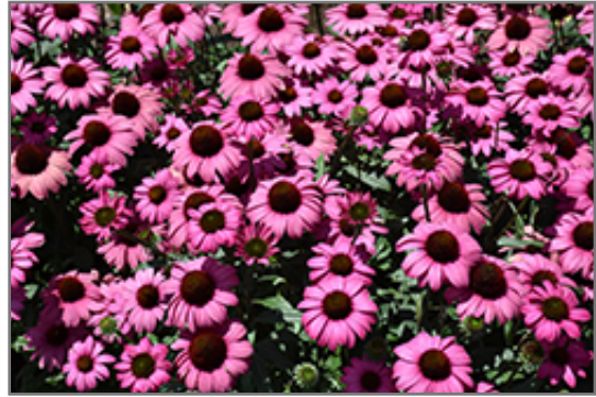
Prima Berry Coneflower flowers

Prima Berry Coneflower is recommended for the following landscape applications;