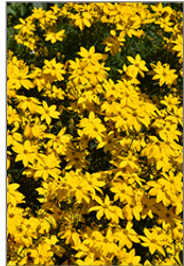
Tickseed flowers

Tickseed is recommended for the following landscape applications;