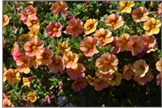
MiniFamous Uno Orange + Red Vein Calibrachoa flowers

This plant will require occasional maintenance and upkeep. Trim off the flower heads after they fade and die to encourage more blooms late into the season. It is a good choice for attracting bees and hummingbirds to your yard, but is not particularly attractive to deer who tend to leave it alone in favor of tastier treats. It has no significant negative characteristics.