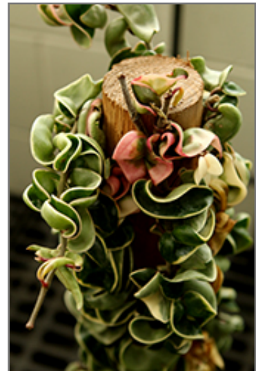
Variegated Rope Plant foliage