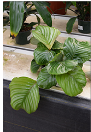
Orbifolia Prayer Plant in full

The Original Family-Owned Garden Center 4320 Bridgeboro Road Moorestown, NJ 08057 Garden Center: (856) 461-0567 Landscaping: (856) 461-3359