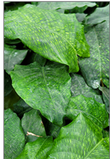
Network Calathea foliage

The Original Family-Owned Garden Center 4320 Bridgeboro Road Moorestown, NJ 08057 Garden Center: (856) 461-0567 Landscaping: (856) 461-3359