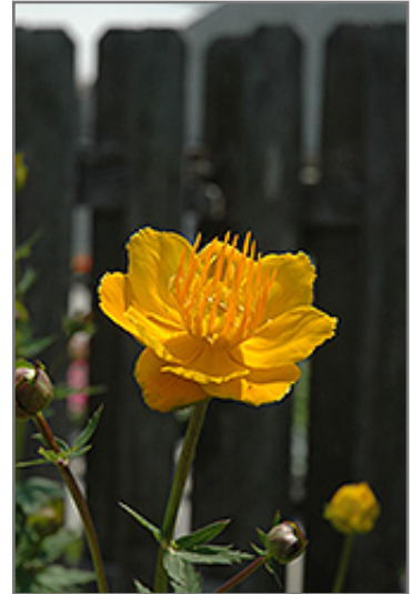
Orange Princess Globeflower flowers

Orange Princess Globeflower will grow to be about 24 inches tall at maturity, with a spread of 24 inches. When grown in masses or used as a bedding plant, individual plants should be spaced approximately 18 inches apart. It grows at a medium rate, and under ideal conditions can be expected to live for approximately 10 years. As an herbaceous perennial, this plant will usually die back to the crown each winter, and will regrow from the base each spring. Be careful not to disturb the crown in late winter when it may not be readily seen!