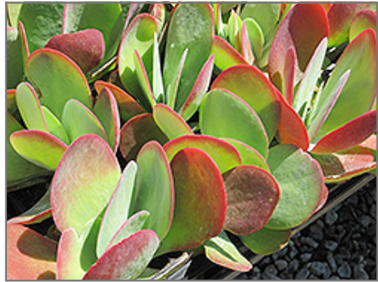
Paddle Plant

Paddle Plant will grow to be about 24 inches tall at maturity extending to 3 feet tall with the flowers, with a spread of 24 inches. When grown in masses or used as a bedding plant, individual plants should be spaced approximately 18 inches apart. Its foliage tends to remain dense right to the ground, not requiring facer plants in front. Although it's not a true annual, this slow-growing plant can be expected to behave as an annual in our climate if left outdoors over the winter, usually needing replacement the following year. As such, gardeners should take into consideration that it will perform differently than it would in its native habitat.