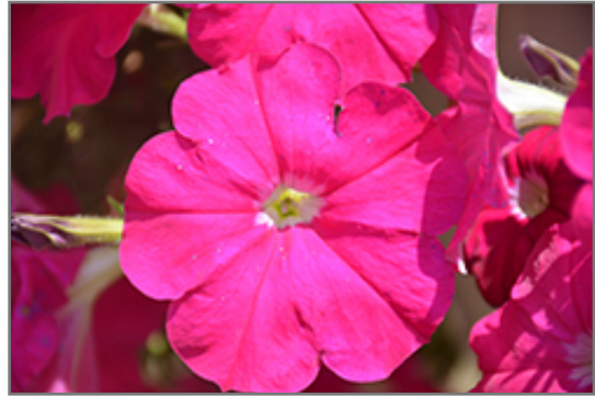
Sanguna Hot Rose Petunia flowers

This plant will require occasional maintenance and upkeep. Trim off the flower heads after they fade and die to encourage more blooms late into the season. It is a good choice for attracting butterflies and hummingbirds to your yard, but is not particularly attractive to deer who tend to leave it alone in favor of tastier treats. It has no significant negative characteristics.