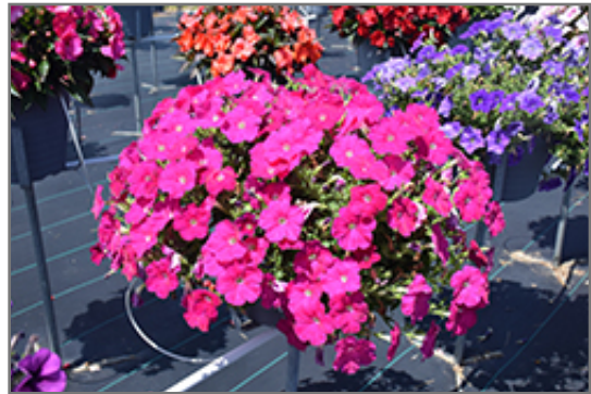
Sanguna Hot Rose Petunia in bloom

The Original Family-Owned Garden Center 4320 Bridgeboro Road Moorestown, NJ 08057 Garden Center: (856) 461-0567 Landscaping: (856) 461-3359