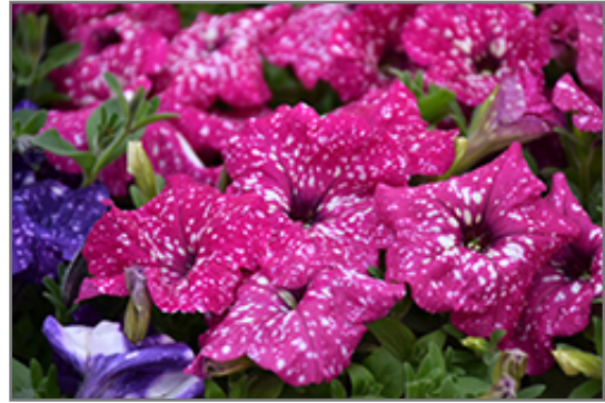
Headliner Pink Sky Petunia flowers

Headliner Pink Sky Petunia is recommended for the following landscape applications;