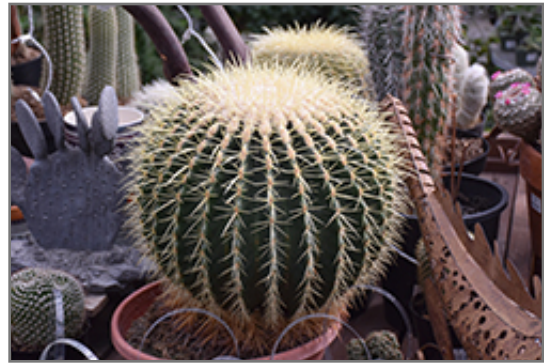
Golden Barrel Cactus in full

Golden Barrel Cactus is a succulent evergreen plant. It is a member of the cactus family, which are grown primarily for their characteristic shapes, their interesting features and textures, and their high tolerance for hot, dry growing environments. Like all cacti, it doesn't actually have leaves, but rather modified succulent stems that comprise the bulk of the plant, and which are designed to hold water for long periods of time. This particular cactus is valued for its distinctive barrel shape, and usually grows as a single spiny ribbed green stem. This plant has yellow cup-shaped flowers held atop the stems from late spring to early summer, which are interesting on close inspection.