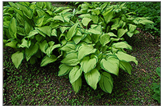
Gold Standard Hosta