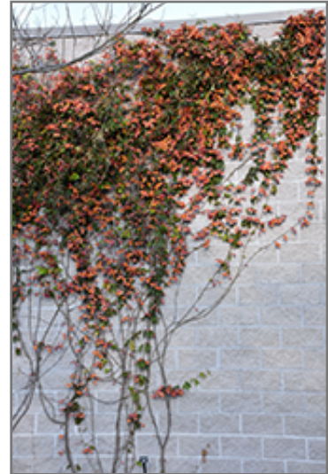
Tangerine Beauty Cross Vine in bloom

This woody vine does best in full sun to partial shade. It is very adaptable to both dry and moist growing conditions, but will not tolerate any standing water. It is not particular as to soil type, but has a definite preference for acidic soils. It is highly tolerant of urban pollution and will even thrive in inner city environments. This is a selection of a native North American species.