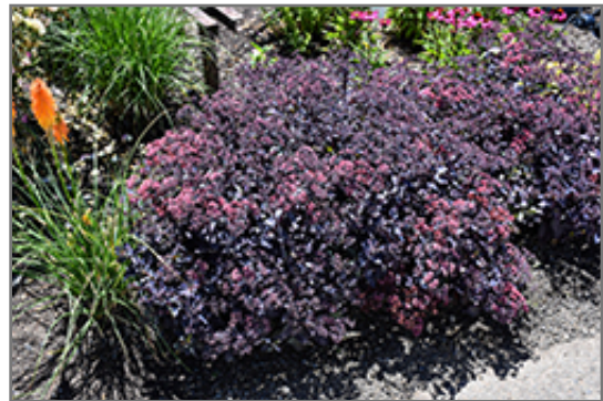
Cherry Truffle Stonecrop in bloom