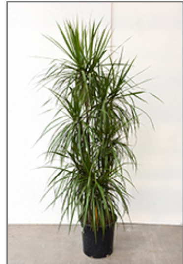
Red-edge Dracaena

When grown indoors, Red-edge Dracaena can be expected to grow to be about 8 feet tall at maturity, with a spread of 4 feet. It grows at a medium rate, and under ideal conditions can be expected to live for approximately 10 years. This houseplant performs well in both bright or indirect sunlight and strong artificial light, and can therefore be situated in almost any well-lit room or location. It does best in average to evenly moist soil, but will not tolerate standing water. The surface of the soil shouldn't be allowed to dry out completely, and so you should expect to water this plant once and possibly even twice each week. Be aware that your particular watering schedule may vary depending on its location in the room, the pot size, plant size and other conditions; if in doubt, ask one of our experts in the store for advice. It is not particular as to soil type or pH; an average potting soil should work just fine.