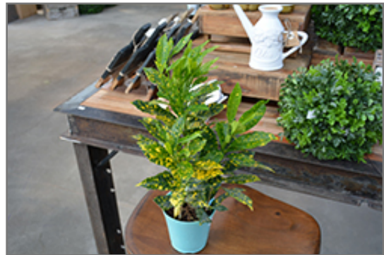
Gold Dust Variegated Croton