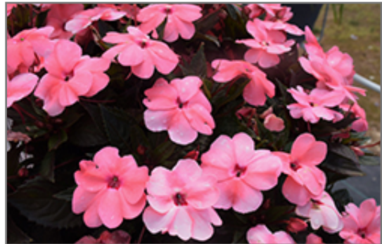
SunPatiens Compact Coral Pink New Guinea Impatiens flowers

This plant will require occasional maintenance and upkeep, and should not require much pruning, except when necessary, such as to remove dieback. It is a good choice for attracting bees and butterflies to your yard. It has no significant negative characteristics.