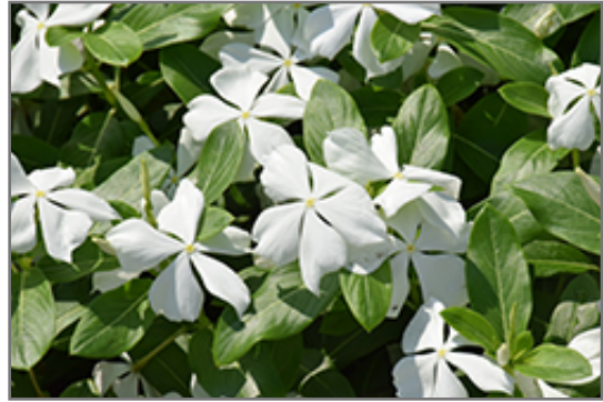
Valiant Pure White Vinca flowers

This plant will require occasional maintenance and upkeep, and should not require much pruning, except when necessary, such as to remove dieback. It is a good choice for attracting butterflies to your yard, but is not particularly attractive to deer who tend to leave it alone in favor of tastier treats. It has no significant negative characteristics.