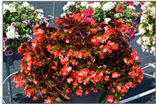
BabyWing Red Begonia in bloom

The Original Family-Owned Garden Center 4320 Bridgeboro Road Moorestown, NJ 08057 Garden Center: (856) 461-0567 Landscaping: (856) 461-3359