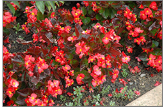
BabyWing Red Begonia flowers

This is a high maintenance plant that will require regular care and upkeep, and usually looks its best without pruning, although it will tolerate pruning. Deer don't particularly care for this plant and will usually leave it alone in favor of tastier treats. Gardeners should be aware of the following characteristic(s) that may warrant special consideration;