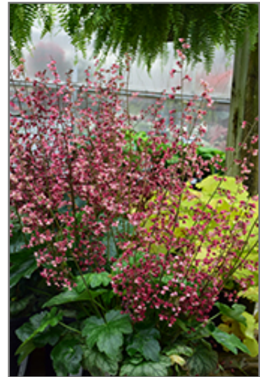
Berry Timeless Coral Bells in bloom

Berry Timeless Coral Bells is recommended for the following landscape applications;