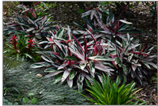
Tricolor Stromanthe

This plant is native to the tropics and prefers growing in moist environments with evenly warm conditions all year round. In our climate, it is usually grown as an outdoor annual in the garden or in a container. If you want it to survive the winter, it can be brought in to the house and provided with special care, and then returned to the garden the following season. In its preferred tropical habitat, it can grow to be around 3 feet tall at maturity, with a spread of 3 feet. However, when grown as an annual or when overwintered indoors, it can be expected to perform differently, and its exact height and spread will depend on many factors; you may wish to consult with our experts as to how it might perform in your specific application and growing conditions.