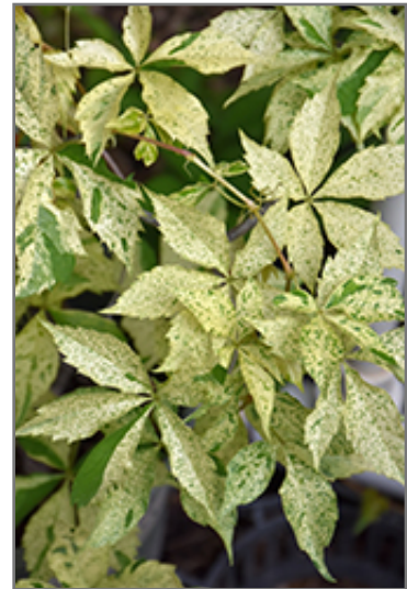
Star Showers Virginia Creeper foliage