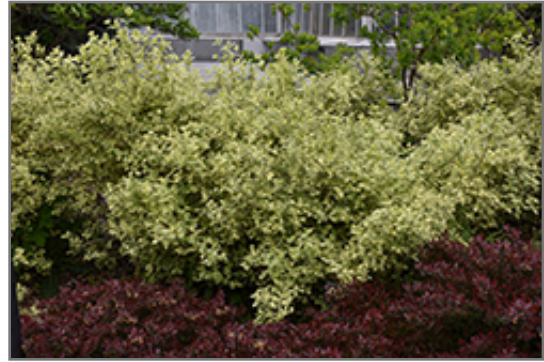
Variegated Mockorange