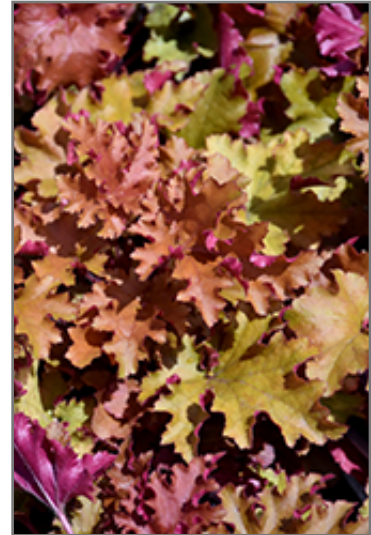
Zipper Coral Bells foliage

Zipper Coral Bells is recommended for the following landscape applications;