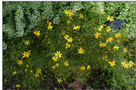
Electric Avenue Tickseed in bloom

The Original Family-Owned Garden Center 4320 Bridgeboro Road Moorestown, NJ 08057 Garden Center: (856) 461-0567 Landscaping: (856) 461-3359